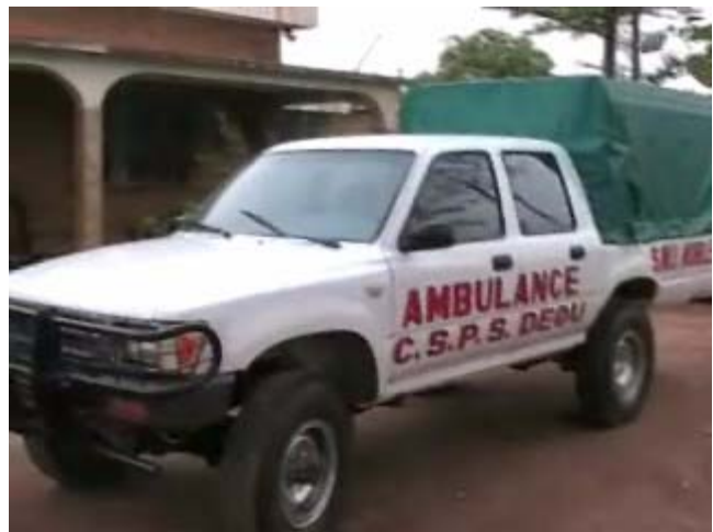
AMURT donated this ambulance for the Deou Medical Center

We have been able to assist the Deou Medical Center to have their own vehicle that will be used for ambulance and also for the SMI Mobile outreach program to the villages. Recently AMURT received funding from NORAD, the Norwegian Development Agency which allows us to build on the midwifery program and launch the SMI Mobile.