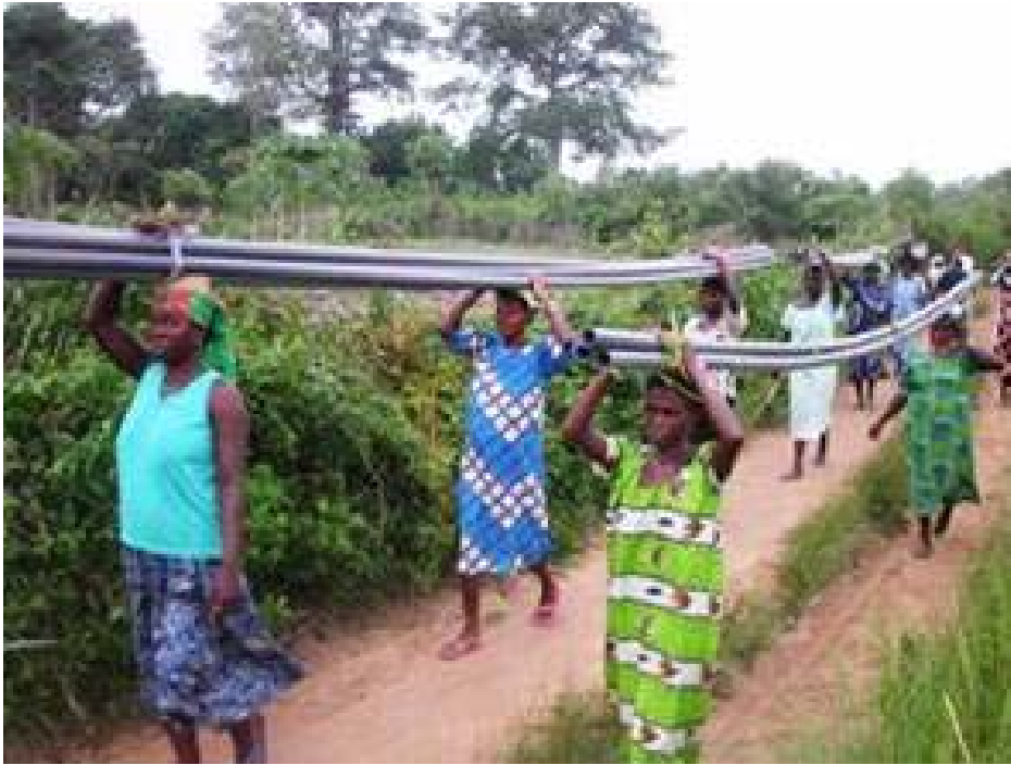
The water project in Ghana is assisted with communal labor. Here women from Wudzrlo are carrying pipes