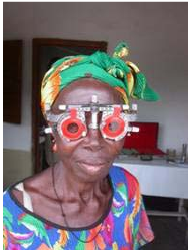
Testing a woman's eyes with a focometer

The Seva Clinic has been lifted to a new level as we began hosting overseas nurse volunteers through Kidworldwide in March. The presence of the volunteers has improved the services at the clinic. In addition to helping to see patients, volunteers have been training the local staff, and have upgraded the procedures at the clinic, which now has a much wider stock of medicines and supplies, and a resource library.