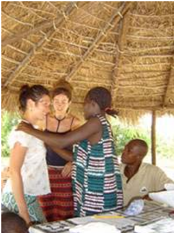
Teaching standard patient assessment procedures to the clinic staff

After a prolonged battle, AMURT finally received VAT exemption for the Zongo Water Project from the Ghana government. Since that time, plumbers, masons, drilling teams, and community organizers have often been compelled to work seven days a week. We faced a tough challenge with installation of the iron pipes on the hill up to the reservoir. But we tamed the hill and it became our friend. The tuning of the electrical installations, the generator and the pumps also gave us many difficulties. Our next task is to ensure the smooth implementation of community management for the Zongo Water Project. This will also give many challenges, as many similar projects are being mismanaged.