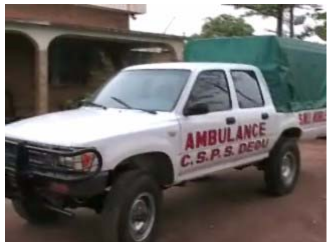
AMURT donated this ambulance for the Deou Medical Center

We have been able to assist the Deou Medical Center to have their own vehicle that will be used for ambulance and also for the SMI Mobile outreach program to the villages. Recently AMURT received funding from NORAD, the Norwegian Development Agency which allows us to build on the midwifery program and launch the SMI Mobile.