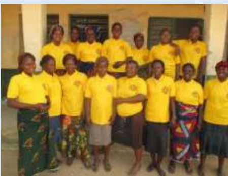
Inikiri Maternal Health Promoters