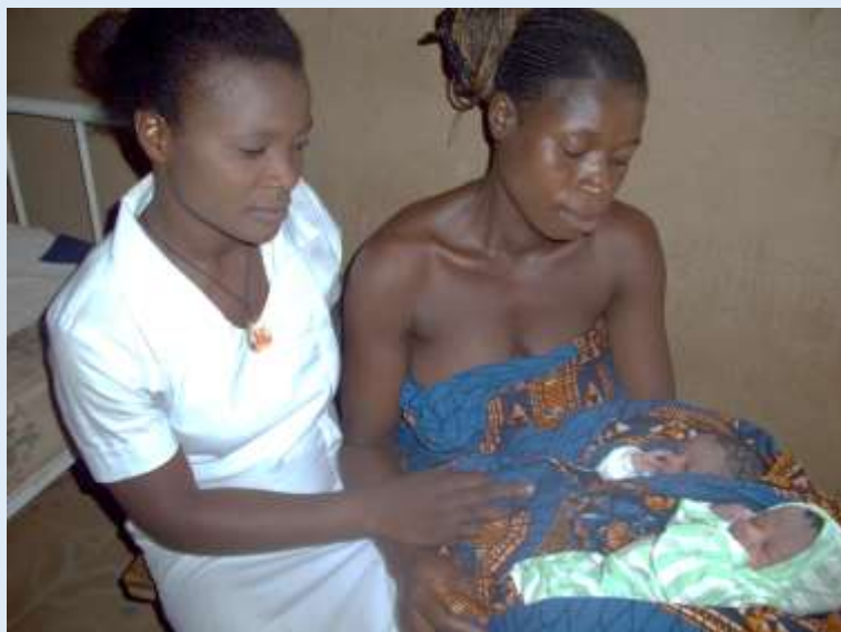
Offia Oji twins