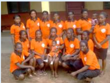
Odeligbo health workers