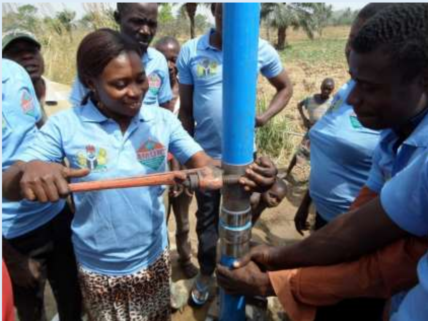
Eguenyi 1 installation