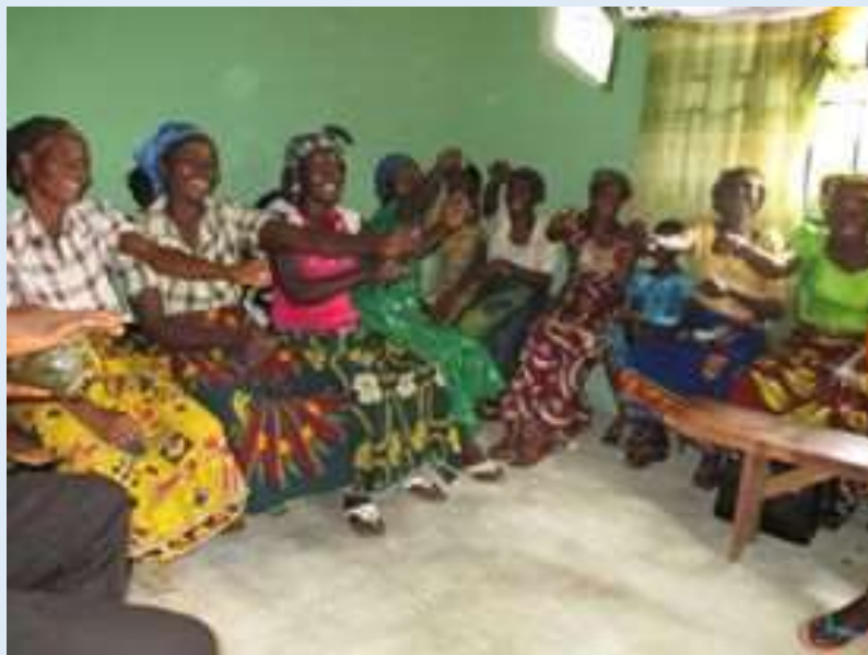
Odeligbo Ifunanya (I Love) group