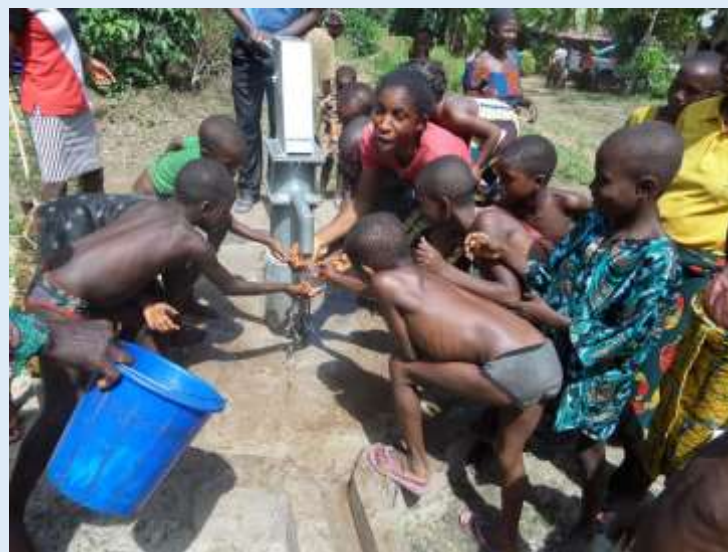
Ajenua new borehole