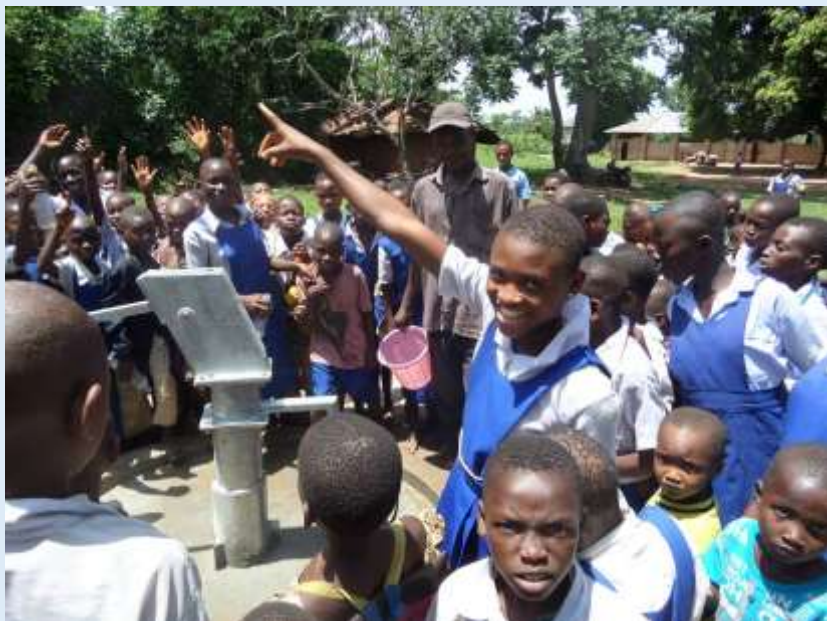
Agugwu new borehole

In 2015 AMURT drilled 16 villages boreholes and 2 health center boreholes. Another 4 boreholes were drilled in Abia State. All the villages paid 5 % as a local counterpart. Priority was given to remote villages without any source of safe water. With the increase in cholera outbreaks in Ebonyi State in 2015 the importance of the Water, Sanitation and Hygiene programs (WASH) became clear to all the partners.