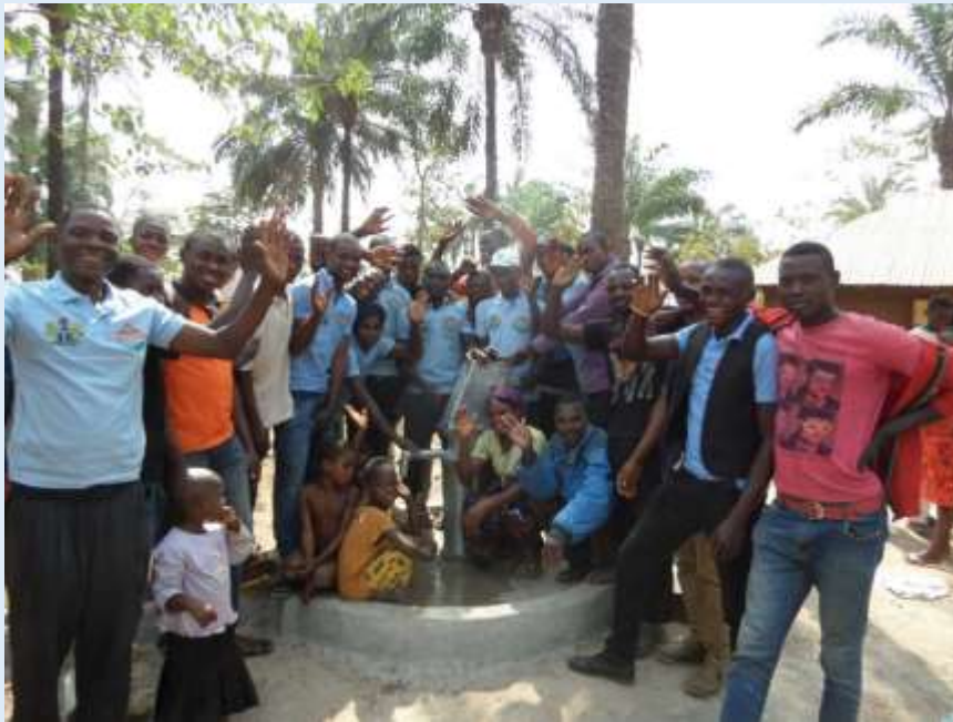
Otoebu new borehole