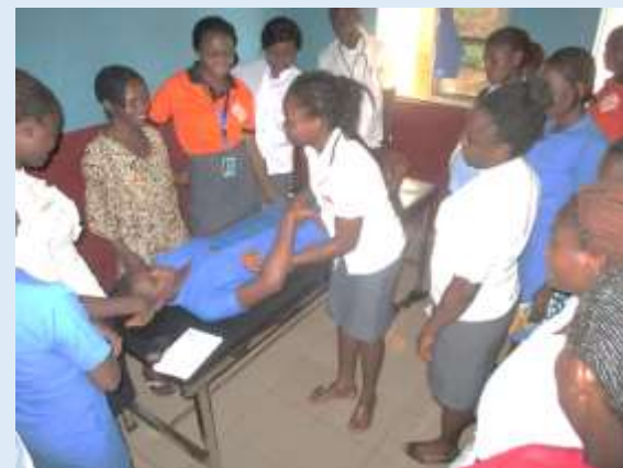
Offia Oji training of health workers