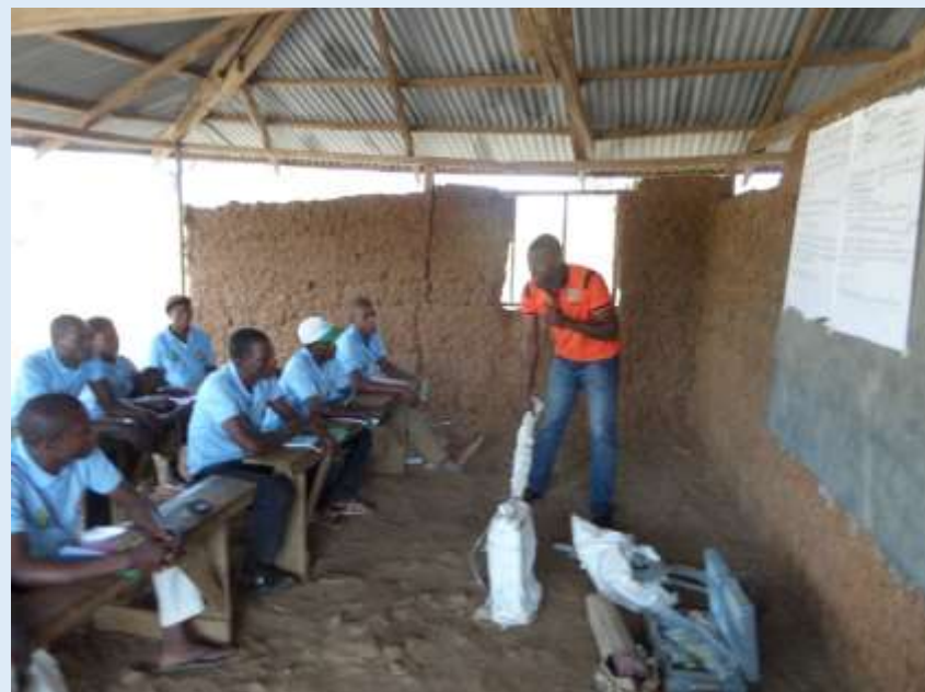
Otoebu WASHCOM training

After the assessment and identification of villages for the WASH program, AMURT conducts a one day sensitization program for the whole community. On this day the villagers will elect 12 men and women to be their WASHCOM (Water, Sanitation & Hygiene Committee). They also identify the exact preferred location for the drilling of the borehole. The WASHCOM training covers maintenance and repair of boreholes, and each village gets a toolbox with all tools necessary to repair their borehole. The training also covers protection of water sources, hygiene and sanitation, and critical health issues like family planning, female genital mutilation and Lassa Fever.