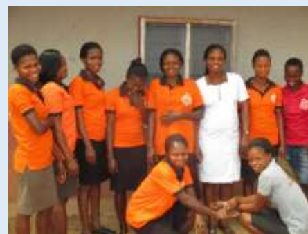
Ephuenyim health workers