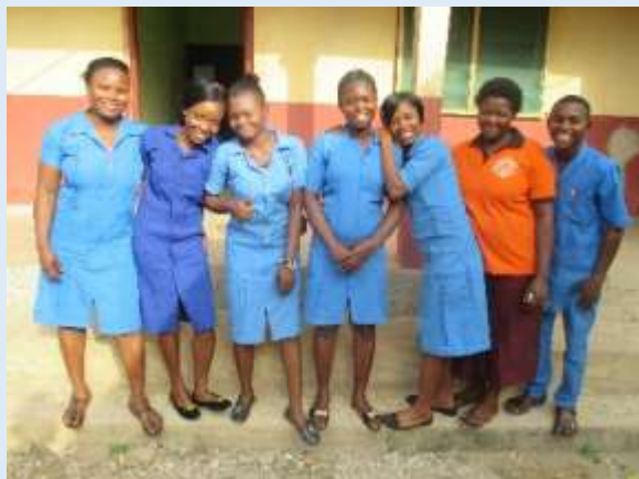
Odeligbo & Elugwu Ettam Trainees