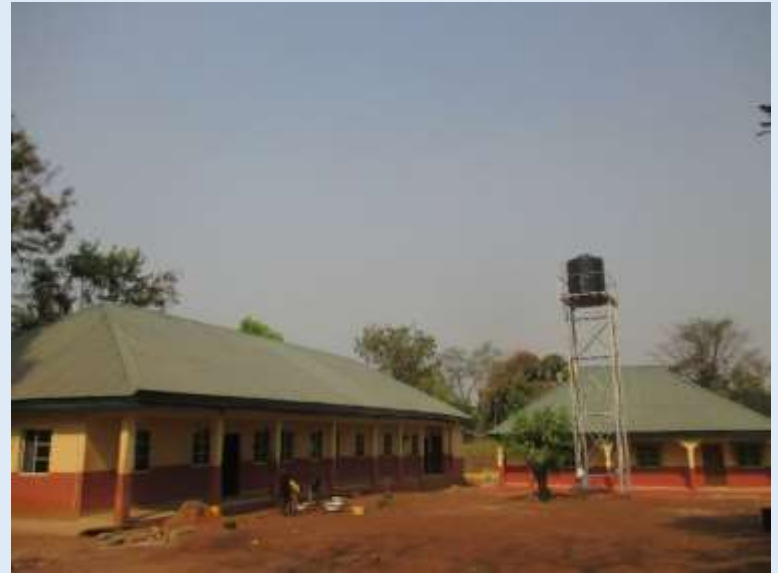
Akparata Health Center and Staff Quarters

The new health center in Akparata, (Effium Community), Ohaukwu LGA opened on 1 st April 2015. The community took the lead in the construction of the facility which also include staff quarters and mechanized borehole. As the closest health center is 12 km away at Okporo, Effium, the patronage has been good with 2026 patients, 557 ante-natal care bookings and 120 deliveries in nine months of operation. AMURT signed a Memorandum of Understanding with Inikiri, 6 km from Akparata, to open another health center. The construction has reached roofing level.