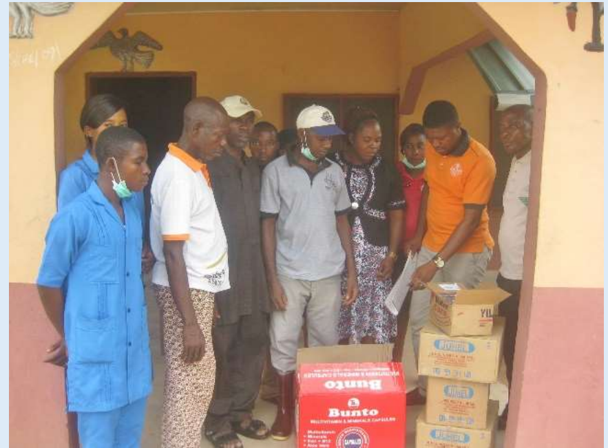
Elugwu Ettam cholera intervention

In January, Elugwu Ettam community suffered an outbreak of cholera. AMURT intervened. We treated 20 patients with severe cholera and many more with oral rehydration. Only one life was lost. We supplied Waterguard (chlorin to disinfect community water supply) and did health education to increase awareness of the causes and symptoms of cholera and how to prevent future outbreaks . Based on a request from the Ebonyi State Ministry of Health, AMURT prioritized cholera affected areas. Boreholes were drilled and WASHCOMs trained at the villages of Otoebu and Ndeagu Umuokoro in Ngbo community, and Elubu, Effium, all Ohaukwu Local Government area. AMURT intends to assist more cholera affected areas in 2016.