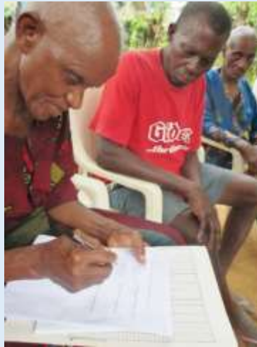
Inikiri signing MOU