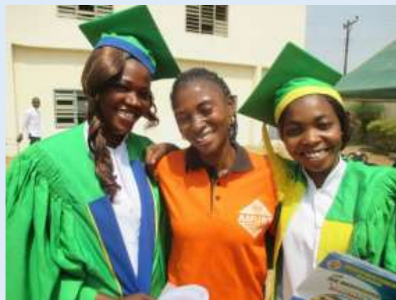
AMURT Scholarship Students – School of Health