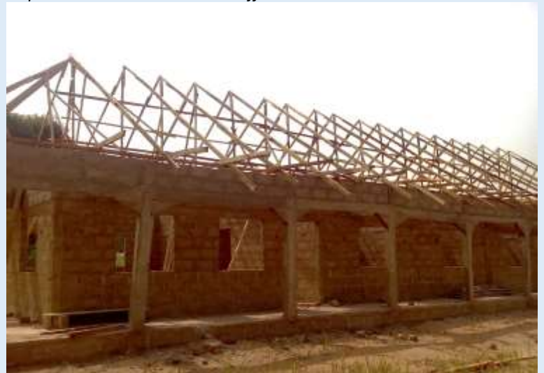
Inikiri health center under construction