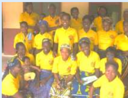
Odeligbo Maternal Health Promoters

As part of AMURT's conditions for the free delivery program, the women in each village have to elect a maternal health promoter from amongst themselves. They conduct monthly pregnant women support group meetings and work closely with health workers from the health center. Their responsibilities include identifying pregnant women, educating and guiding expectant mothers, and monitoring pregnancies and deliveries. As community based volunteers, they ensure that the program is well anchored at the grassroots, and play a key role in promoting safe motherhood in communities. The maternal health promoters are well placed to support any village based health campaign or initiative.