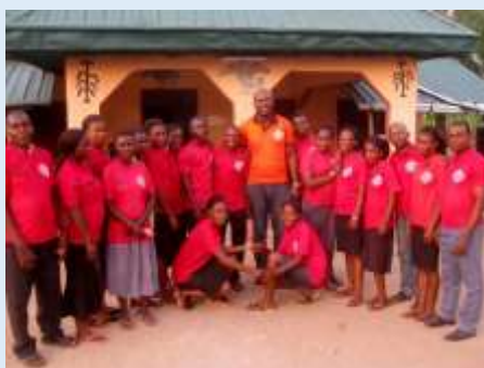
Elugwu Ettam health workers