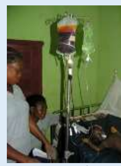
Odeligbo care for child