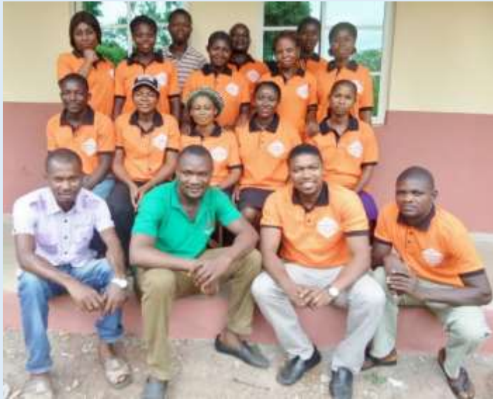
Akparata Health Center staff and AMURT staff on opening day

The new health center in Akparata, (Effium Community), Ohaukwu LGA opened on 1 st April 2015. The community took the lead in the construction of the facility which also include staff quarters and mechanized borehole. As the closest health center is 12 km away at Okporo, Effium, the patronage has been good with 2026 patients, 557 ante-natal care bookings and 120 deliveries in nine months of operation. AMURT signed a Memorandum of Understanding with Inikiri, 6 km from Akparata, to open another health center. The construction has reached roofing level.