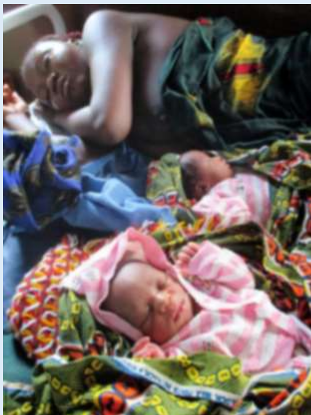
Odeligbo mother & newborn twins. We 36 twin births in 2015