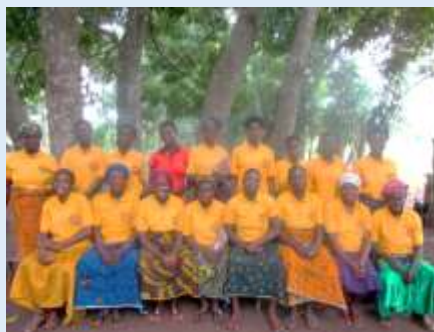
Akparata Maternal Health Promoters