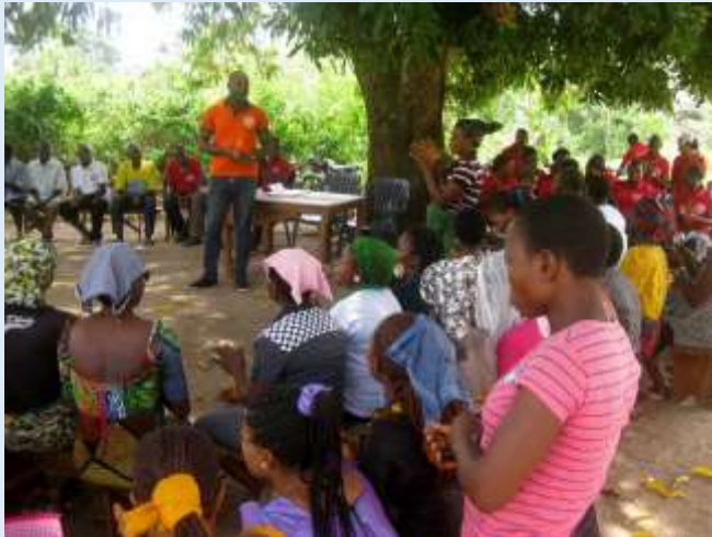
Elugwu Ettam community meeting