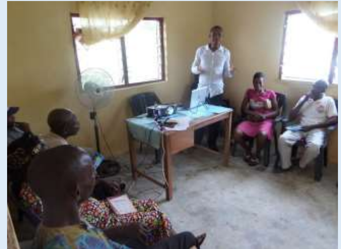
Odeligbo Management committee training

As outlined in the MOU with the Ebonyi State government, the AMURT model closely resembles Nigeria's Ward Health System. The community owns the health centres and is in charge of the management. All the health facilities have been located and constructed with significant contribution of labour and materials from the local communities. As a result, the community feels a strong sense of ownership of the health centres. Each of the health centres has a management committee elected from the local community. With a modest mark up on drugs, they are able to restock all drugs and supplies and pay for operating expenses such as fuel, cleaners, and maintenance. They also save funds for repairs, improvements and expansion of the health centres. Each of the health centres has been able to build up savings for long term sustainability. AMURT is responsible for capacity building, support and monitoring of the health centre management committees.